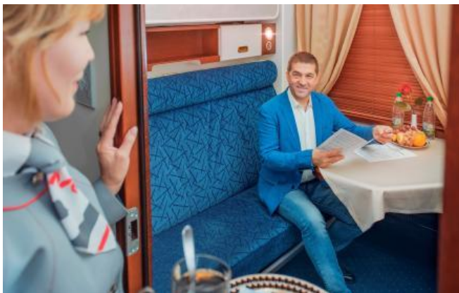
Day Position (example)