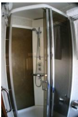
Private shower cabin en-suite