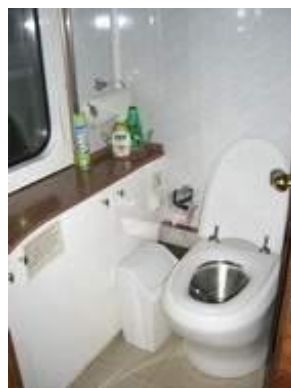
Private toilet and washbasin en-suite