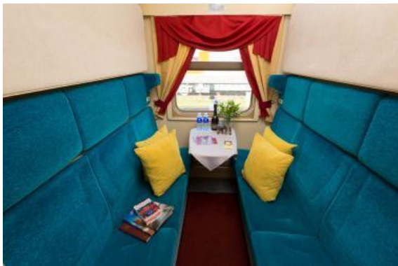
Standard Plus Day Position (example)