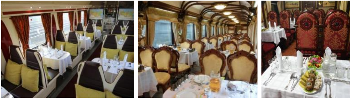
Restaurant Cars (Examples)

There are restaurant cars on the train which serve breakfast, lunch, and dinner as part of the full board service to all passengers of the Northern Lights Express. Local cuisine is part of the menu. During sightseeing tours in the cities local meals are served in the specially selected restaurants.