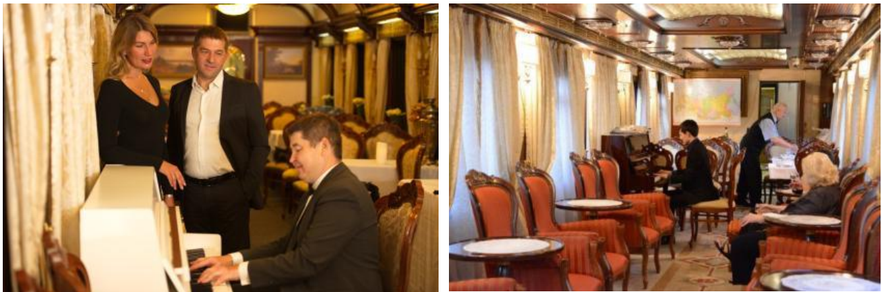
Lounge Car (Example)

This is the most popular place of the train and open to all passengers until late. Come, sit down, enjoy the scenery passing by the window and relax while having a drink and listening to the piano entertainment after dinner.