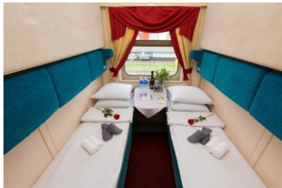
Standard Plus Night Position (Example)