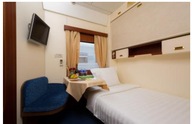
Night Position (example)